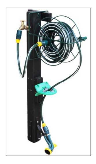
Fig. 1. Recommended set up with hose guide