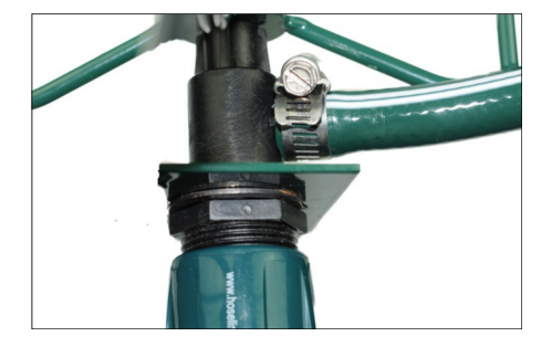
Fig 4. Inside connection of hose reel connection

Now Australia's most preferred and trusted garden hose fittings, hoses, hose reels and garden products.