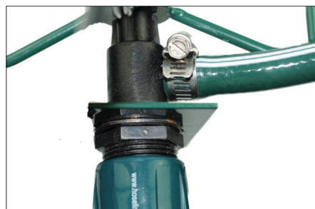
Fig 4. Inside connection of hose reel connection

Now Australia's most preferred and trusted garden hose fittings, hoses, hose reels and garden products.