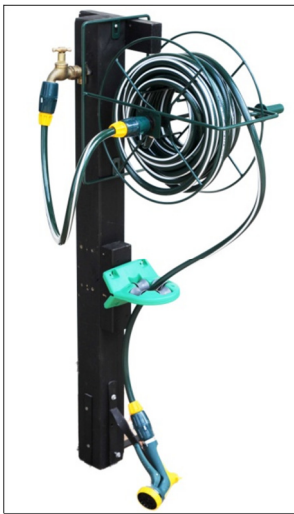
Fig. 1. Recommended set up with hose guide