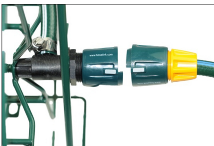
Fig. 3. Outside connection of hose reel connection